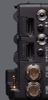
PIX-E5 Left Panel