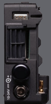
PIX-E5 Right Panel